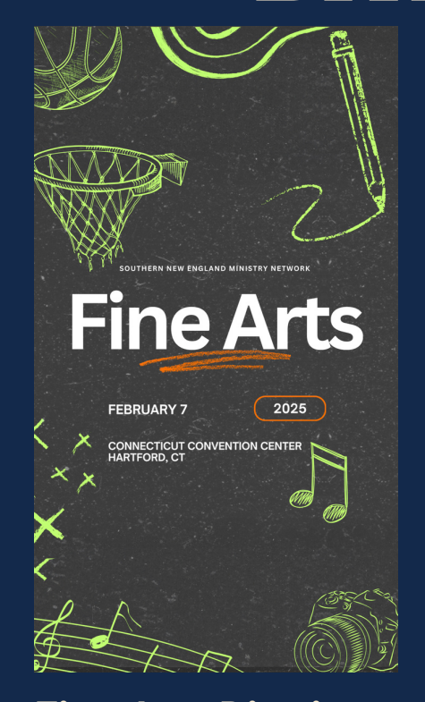
Fine Arts Districts Feb 7 Hartford CT