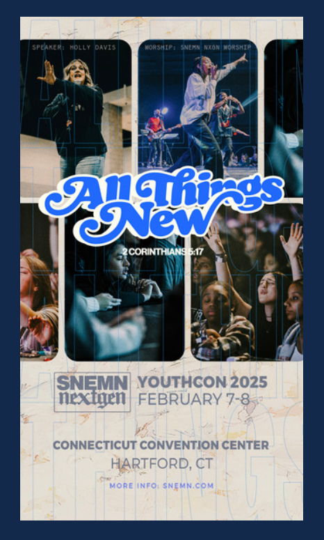
Youth Convention Feb 7-Feb 8 Hartford CT